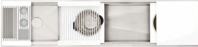
Designer White Resin*