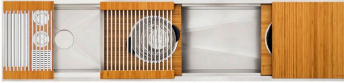
Natural Golden Bamboo