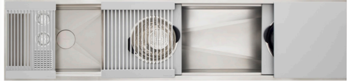
Exclusive Gray Resin*