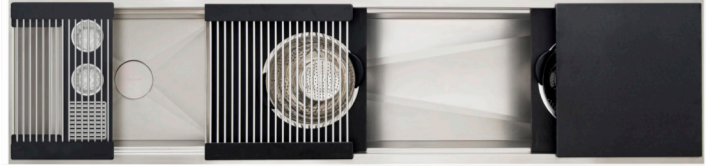
Graphite Wood Composite